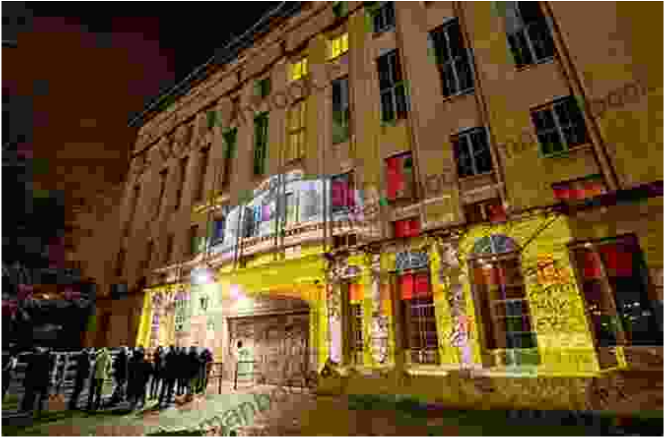
Berghain, Berlin, Germany