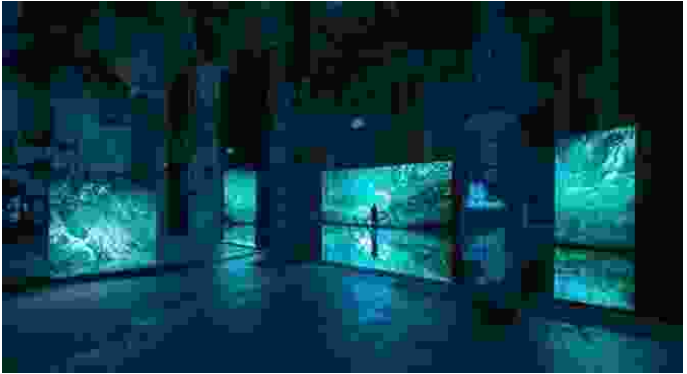
The Berghain dance floor