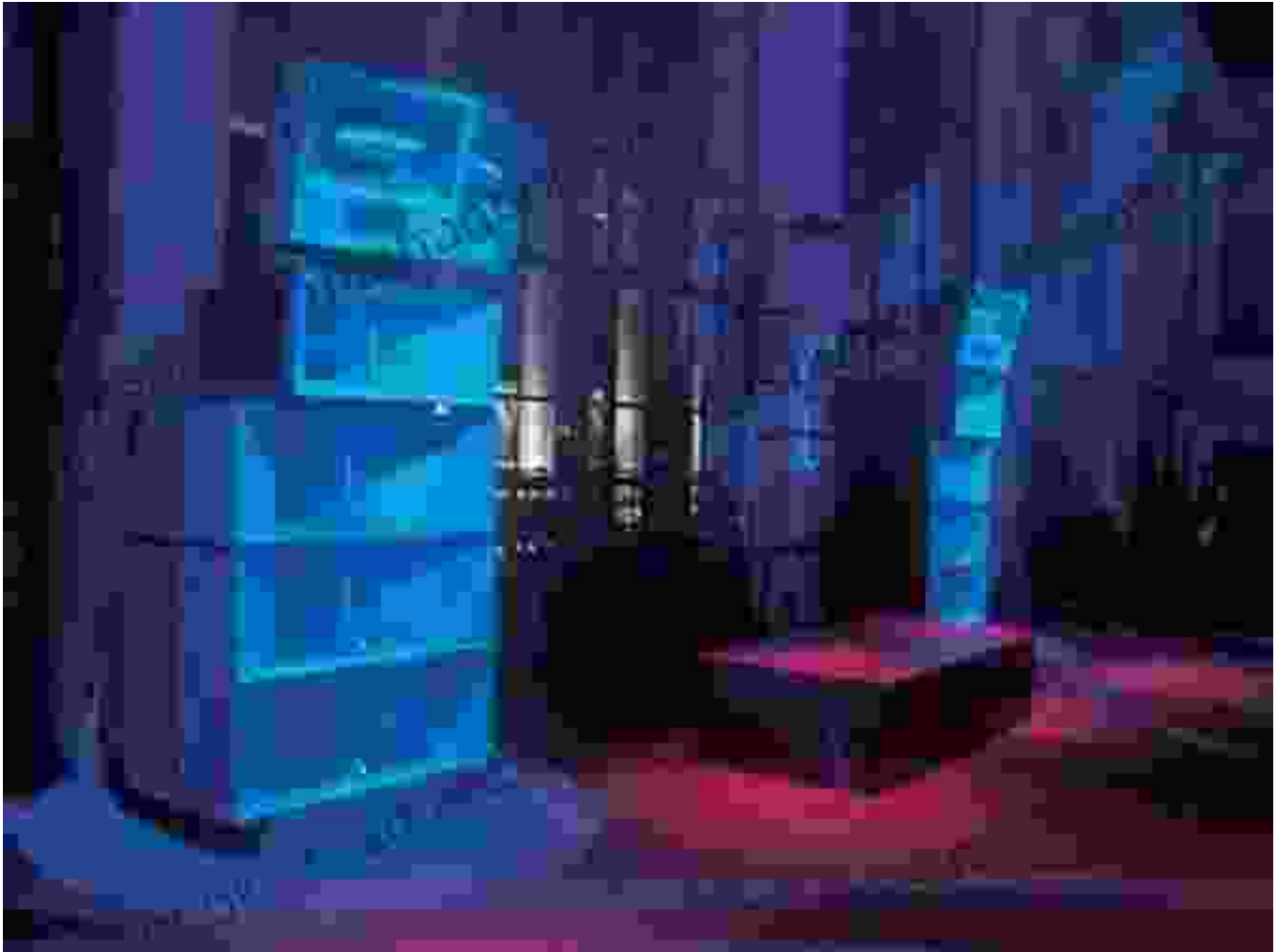
The Berghain Funktion-One sound system