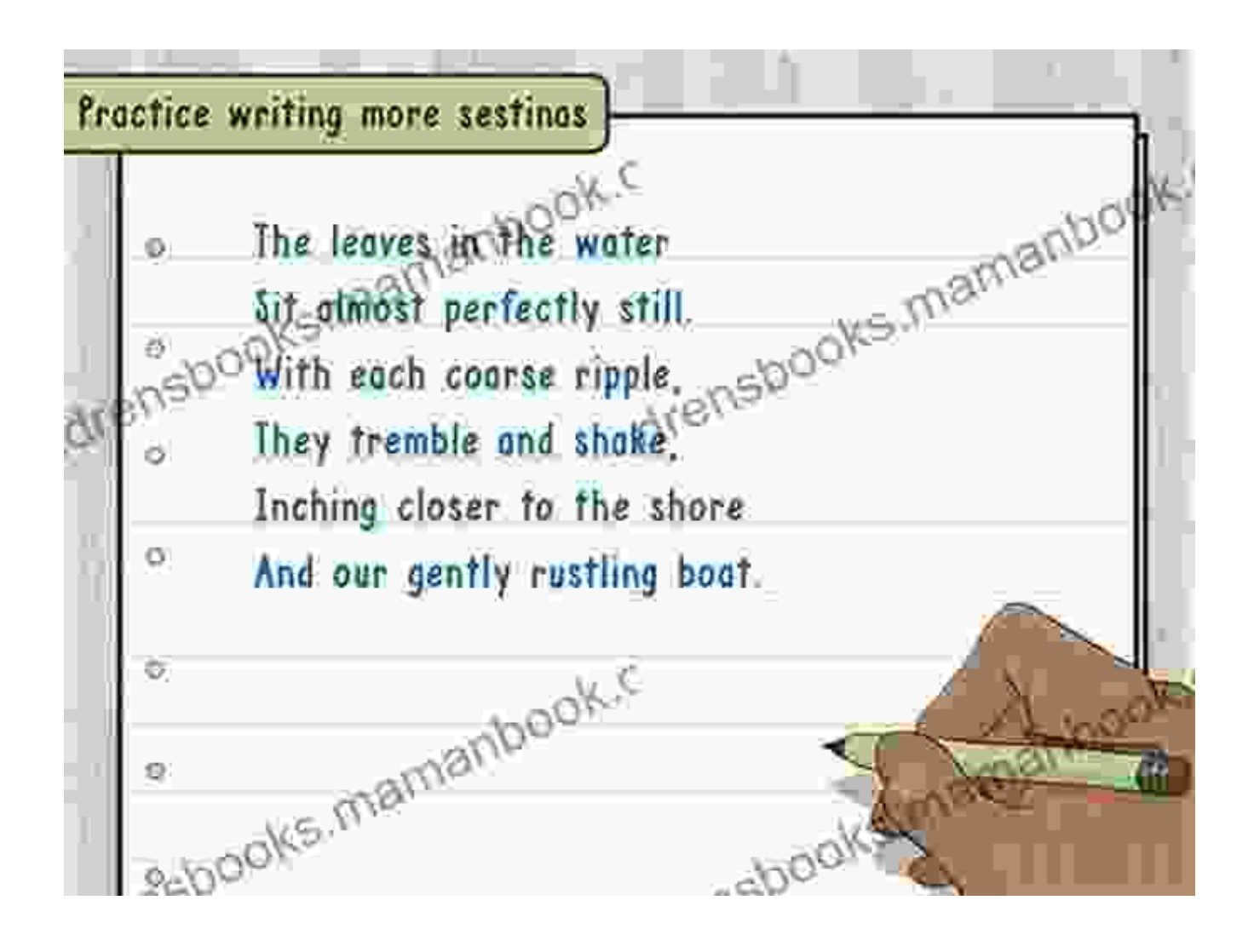
Figure 1: Diagram of a sestina

Sestinas are a challenging poetic form consisting of six stanzas of six lines each, followed by a three-line envoy. The unique aspect of sestinas lies in the way the end-words of each stanza are repeated in a predetermined order. In The Incredible Sestina Anthology , Nester employs this structure with remarkable dexterity, creating a sense of both constraint and fluidity.